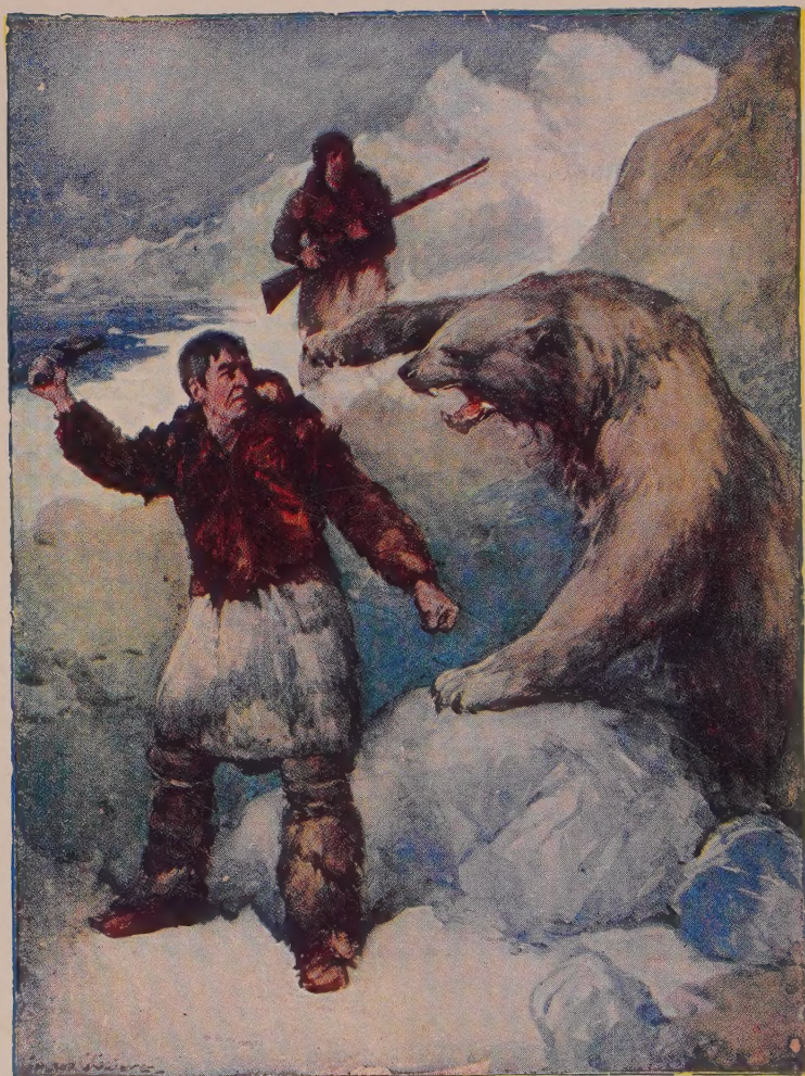
"The man aimed a blow at the bear's head."